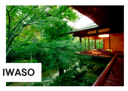
160 year history Iwaso inn constantly watching over history since 1854(late Edo era).